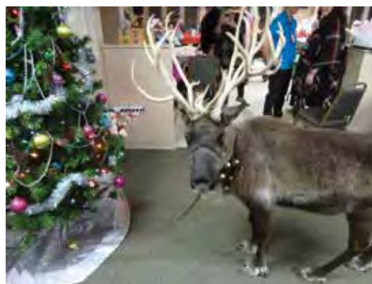
Holly the reindeer was such a big hit last year, she will be returning this year Dec. 11 & 12.

December 12th - East & South Wings Santa & Holly the Reindeer