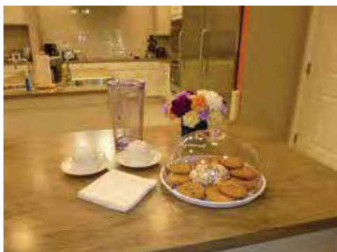
We always have freshly baked cookies at The Greens!