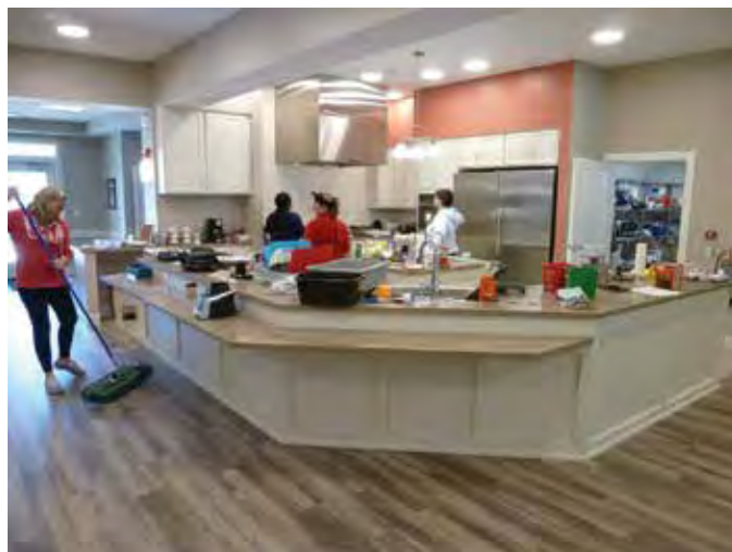
At The Greens daily life is based on three fundamental core values, Meaningful Life ~ Empowered Staff ~ Real Home.